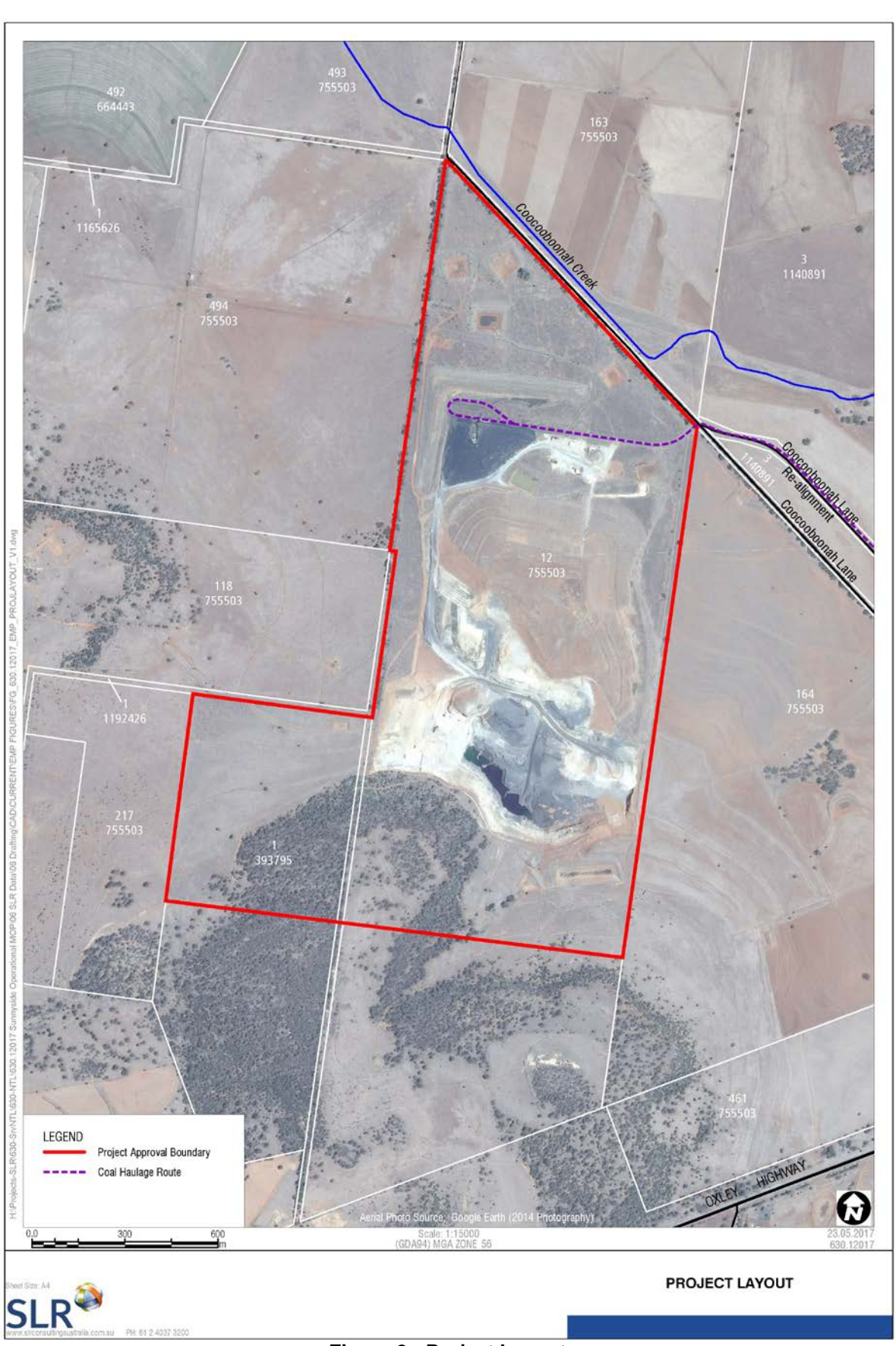
Figure 2 - Project Layout